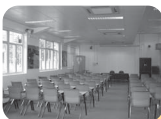
Designated Lecture Room for CAP courses 教練級別評定計劃各級課程的專用講授室