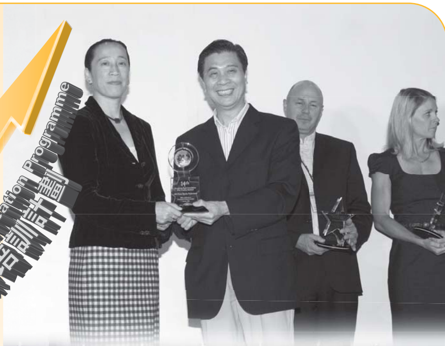
Hongkong Bank Foundation Elite Coaches Seminar 滙豐銀行慈善基金精英教練員研討會

Hongkong Bank Foundation Coach Education Programme 滙豐銀行慈善基金教練培訓計劃