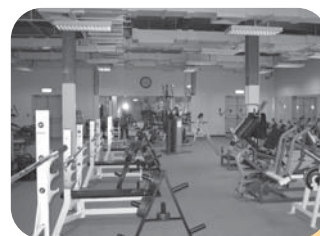
Fitness Training Centre 體能訓練中心