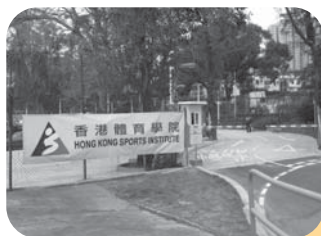
Main Entrance of the HKSI 香港體育學院正門

隨著教練培訓部於2006年12月底搬遷至烏溪沙青年新村，各項教練培訓活動已於2007年1月正常運作。